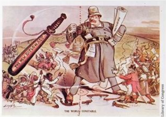
This cartoon shows President Theodore Roosevelt as the world policeman.

Throughout the 1800s, the Caribbean country of the Dominican Republic suffered from instability and corruption. It was ruled repressively by Spain, and after winning its independence in the late 1800s, the country was left in a state of lawlessness, confusion, and disorder. Soon after the Dominican Republic gained independence, Ulises Heureaux took power. Heureaux made many improvements in education, transportation, and roads, and encouraged foreign investment into the country. Americans and Europeans began to invest in Dominican industry, selling equipment and helping with the development of water and power supplies. They also invested in land purchases to start producing export crops. However, Heureaux was also corrupt, and spent more money than the country could afford on modernization and his own pleasures. He was assassinated in 1899, leaving the