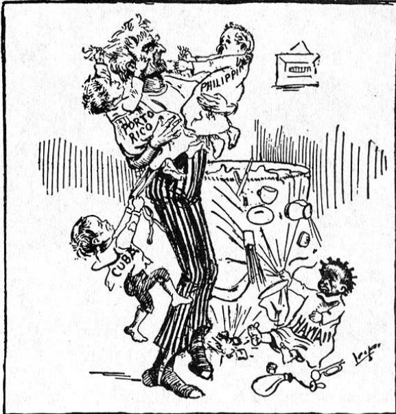
This cartoon shows Uncle Sam holding and surrounded by screaming toddlers representing new territories acquired by the United States after the Spanish-American War of 1898.

In the 1898 treaty ending the Spanish-American War, Spain ceded Puerto Rico to the United States. The United States soon became the dominant power in the Caribbean – a region earlier controlled by European countries. Puerto Rico became a U.S. territory. The U.S. government selected a U.S. governor and executive council to rule the island, and appointed U.S. judges to the Puerto Rico Supreme Court. In spite of U.S. rule, as residents of a U.S. territory, Puerto Ricans were not American citizens and could not travel freely to the United States. This stipulation satisfied American labor leaders and politicians who opposed Puerto Rican immigration to the United States.