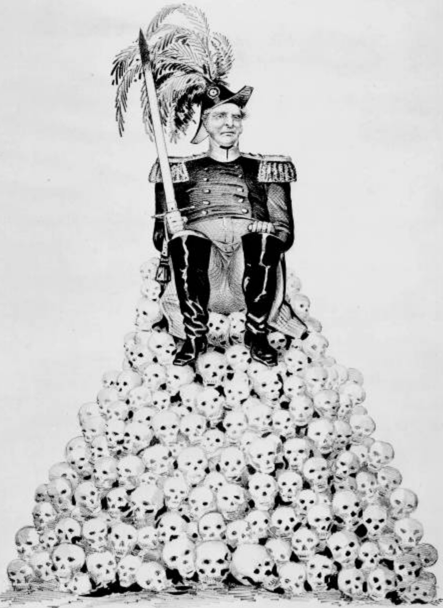
AN AVAILABLE CANDIDATE. THE ONE QUALIFICATION FOR A WHIG PRESIDENT.