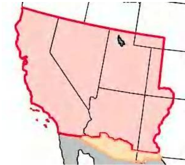
The Mexican Cession