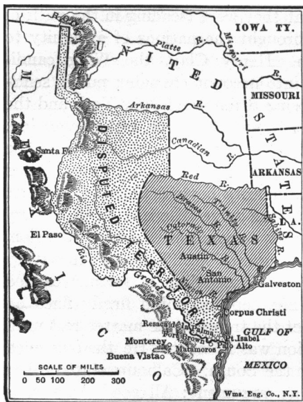
Document D: Map of Disputed Texas Border