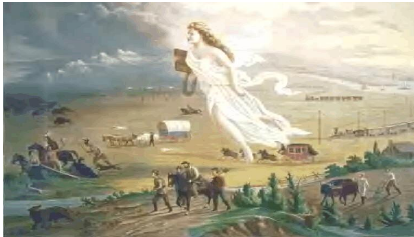
Document B: Manifest Destiny