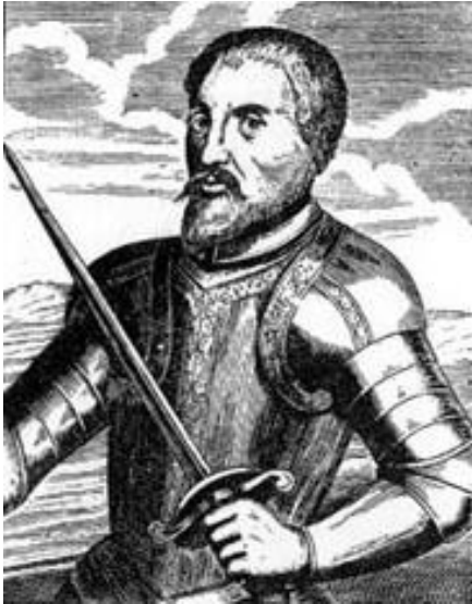
Photo of Hernando De Soto