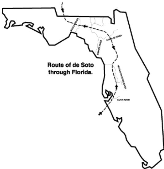
Route of De Soto through Florida