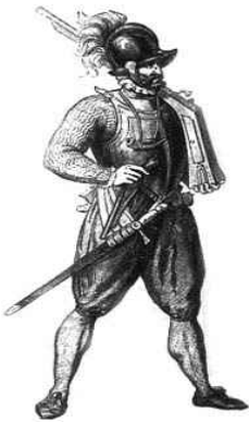
Photo of an armed Spanish Conquistador.