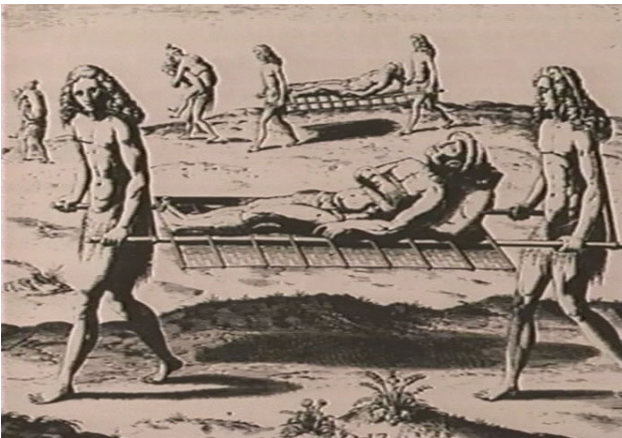
An engraving depicts Native Americans carrying away the dead.