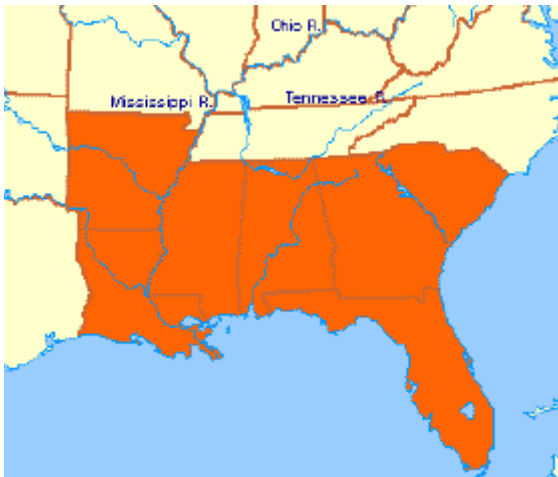
Area explored by Hernando De Soto and his men.