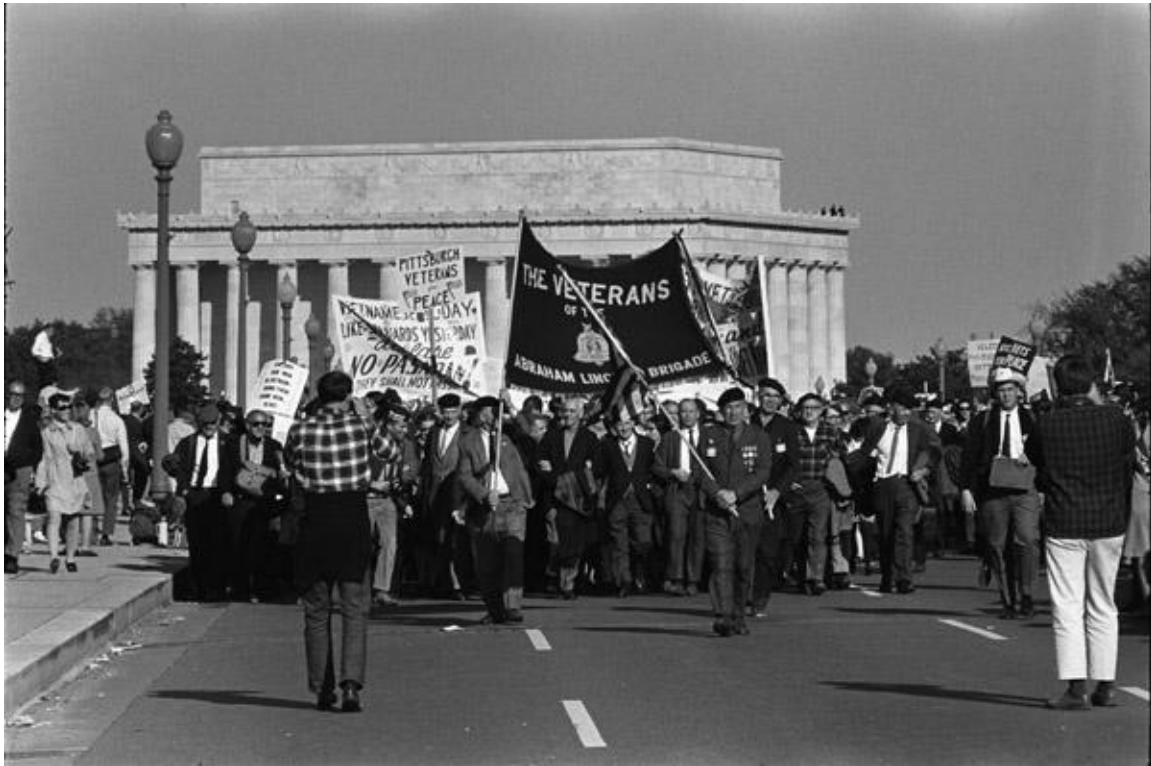
Document F: A photo of the Pittsburg Veterans for Peace at the March on the Pentagon (10-21-1967)