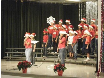
Sandhill Christmas Concert