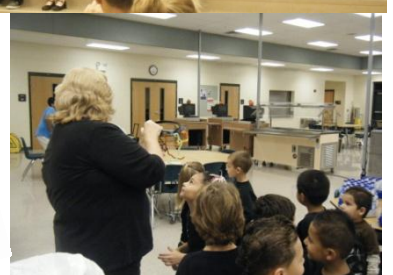
Sleepy Hill Spiders