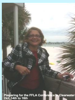
Preparing for the FFLA Conference in Clearwater Oct. 14th to 16th

Have a well deserved Spring Break vacation.