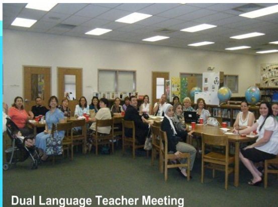
Dual Language Teacher Meeting