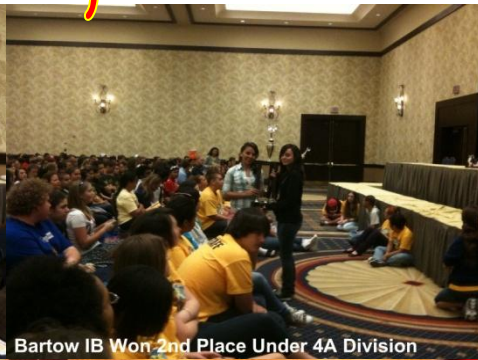
Bartow IB Won 2nd Place Under 4A Division