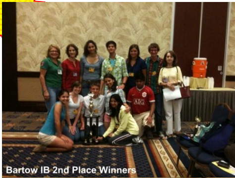
Bartow IB 2nd Place Winners