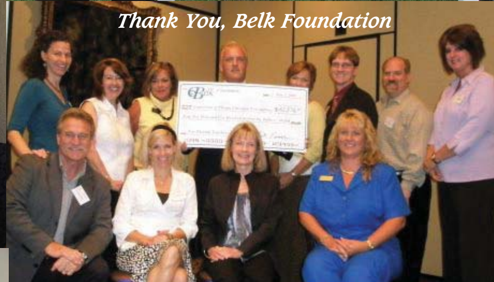
Thank You, Belk Foundation