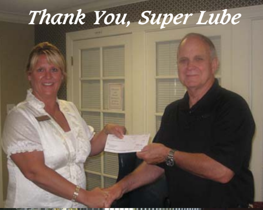
Thank You, Super Lube