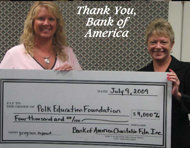
Thank You, Bank of America