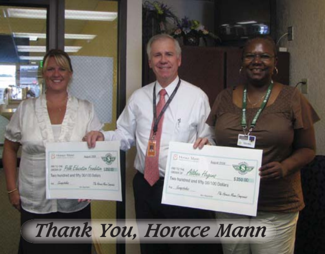
Thank You, Horace Mann