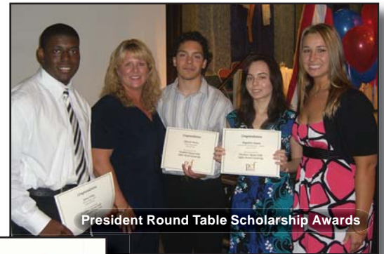
President Round Table Scholarship Awards

328 scholarships were awarded by the Polk Education Foundation this year totaling $ 594,000. Scholarship information for the 2011 year will be available in February on the PEF website.