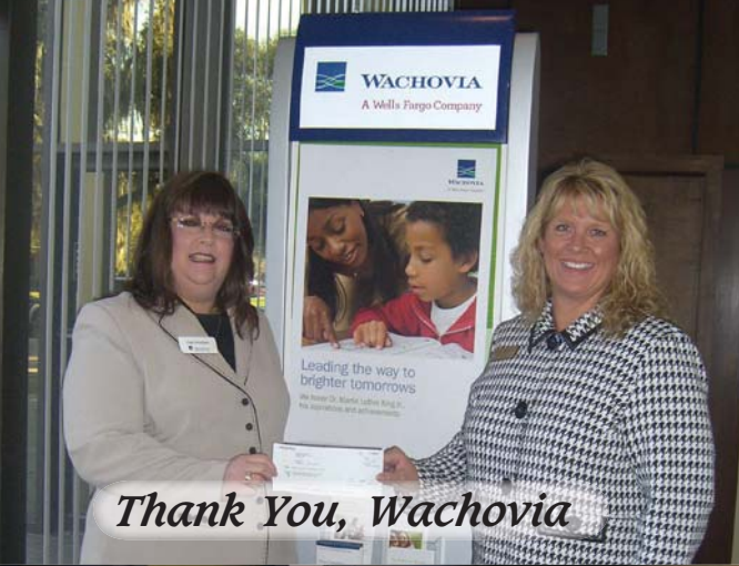
Thank You, Wachovia