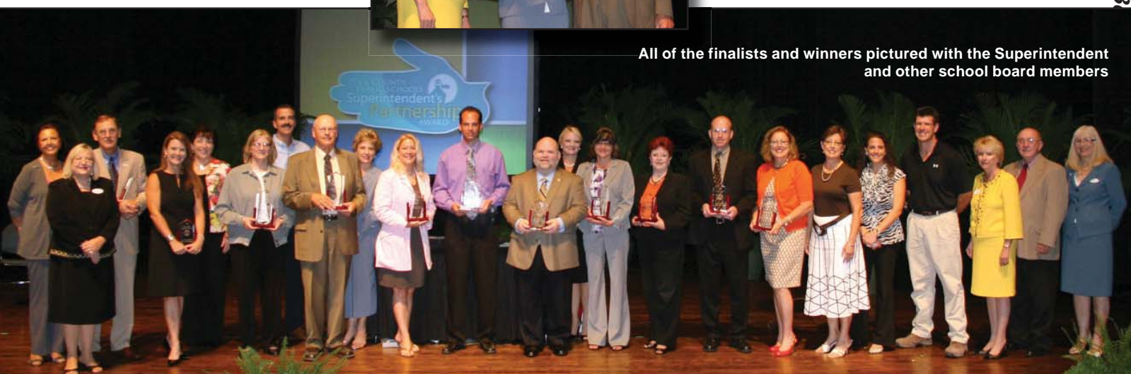
All of the finalists and winners pictured with the Superintendent and other school board members