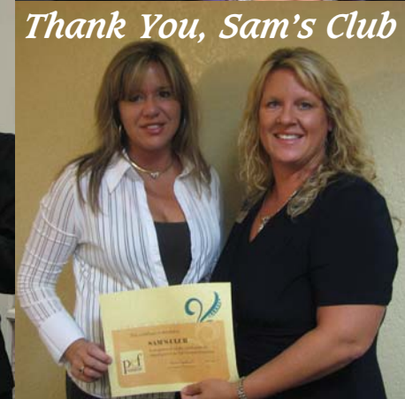
Thank You, Sam's Club