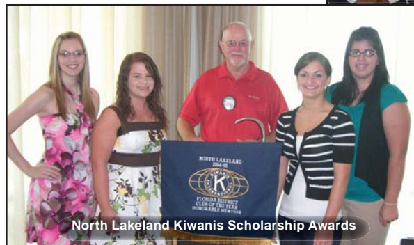
North Lakeland Kiwanis Scholarship Awards