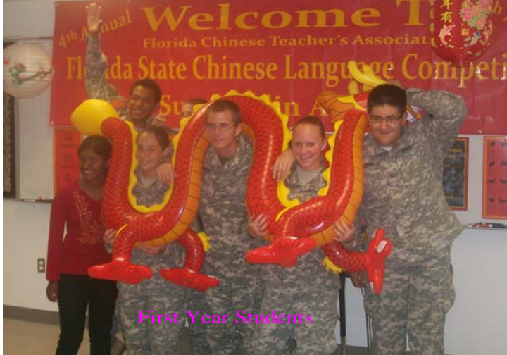
First Year Students