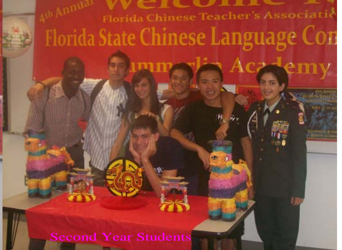
Second Year Students