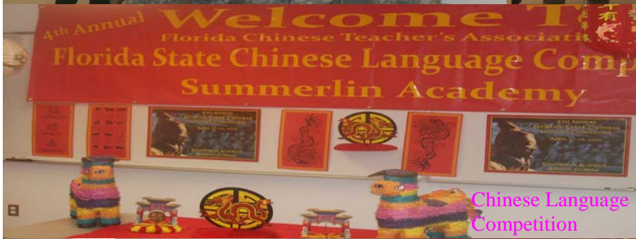
Chinese Language Competition