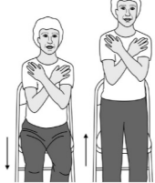
1. Chair Stand