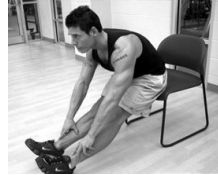
3. Hamstring Stretch