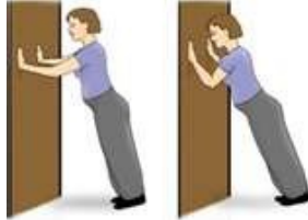
2. Wall Push-Up