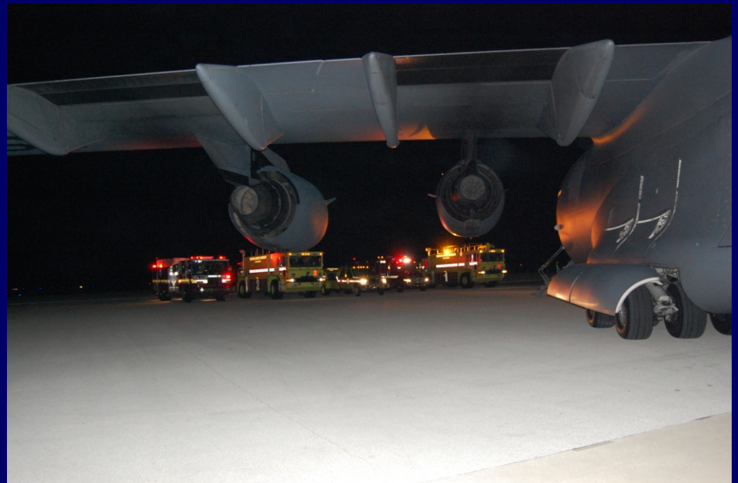
Sanford International Airport, Orlando

-This is a forward element of a federal request for a larger SMRT.