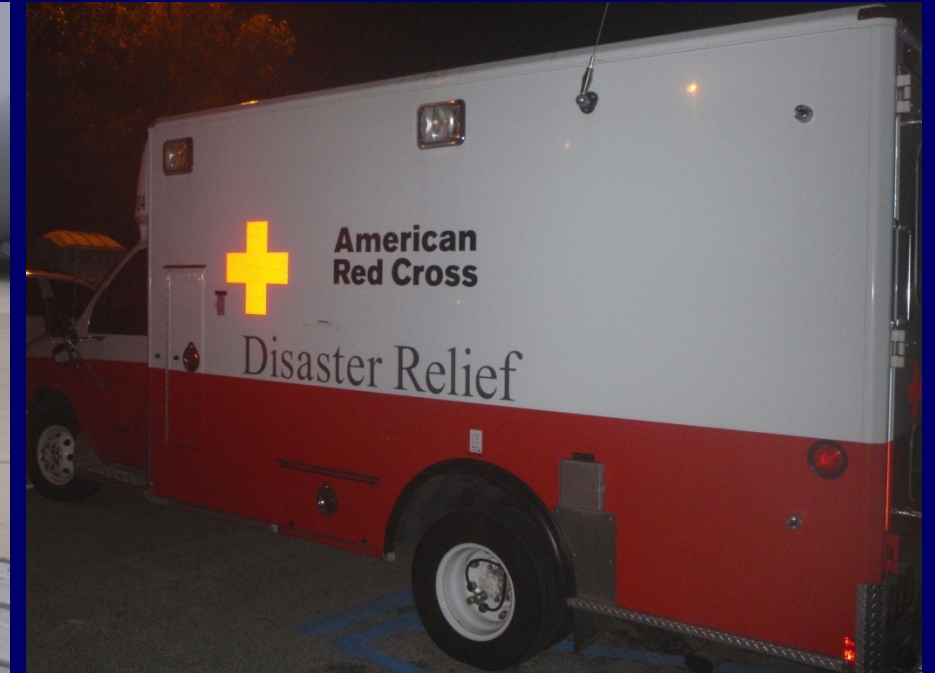
Sanford International Airport, Orlando

174 American Red Cross workers have provided to 2,400 meals, 4,500 snacks, 48 comfort kits, and 350 blankets, serving a total of 3,641 repatriated U.S. citizens in Orlando, Miami, Fort Lauderdale, and Palm Beach.