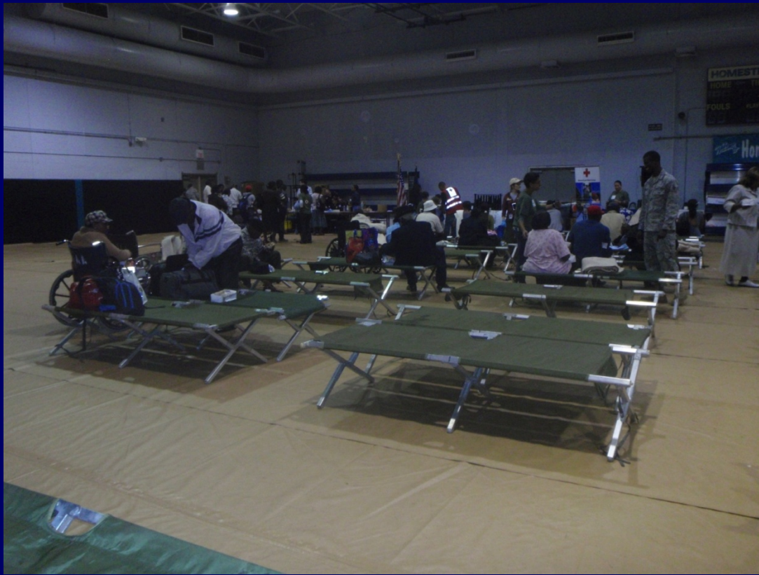
Homestead Repatriation Processing Center

2 recovery staff members of FDEM are on site at Homestead AFB in response to a request by DCF for assistance in tracking costs at the repatriation processing center. An additional 2 FDEM personnel are at the Sanford Repatriation Processing Center.