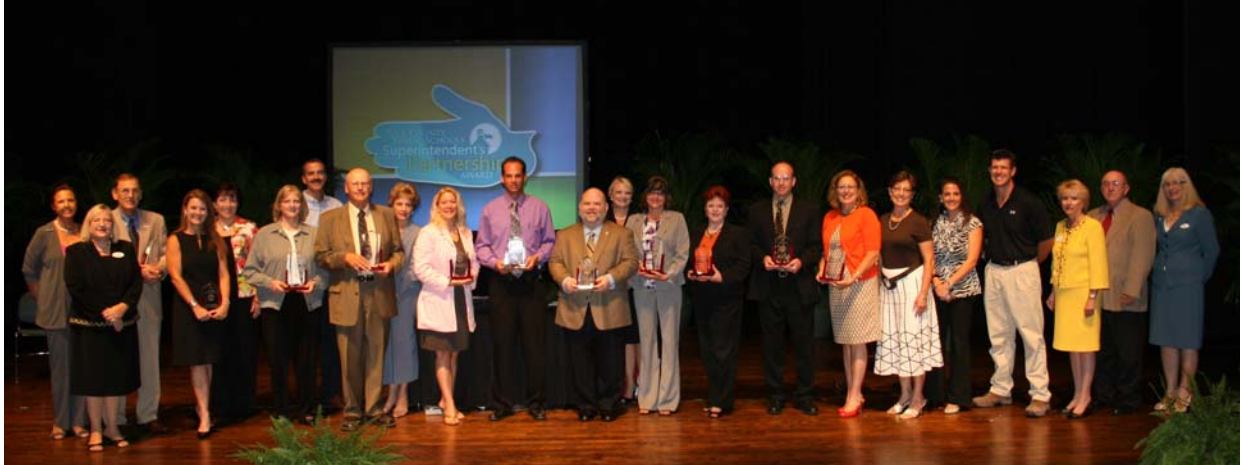
All of the finalists and winners pictured with the Superintendent and other school board members.

District Office Partner of the Year: United Way of Central Florida Polk County Tax Collector's Office Bright House Networks