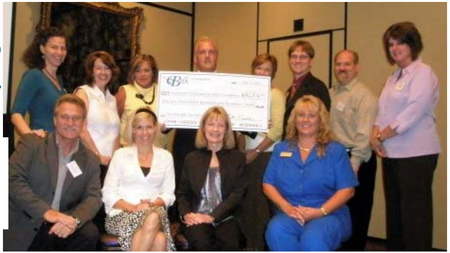
Education Foundations from around Florida gathered to receive their grant checks from Belk.