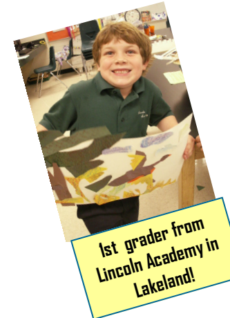
1st grader from Lincoln Academy in Lakeland!

The Department of Fine Arts—Creativity is our forte!